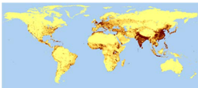
2010 Worldmap of population density

The first phase in the building of the Migration and Global Demographics Observatory will consist in the collection of basic demographic indicators at country level, such as population counts, fertility, mortality, and gender & age structure, as well as migration stocks and flows. These migration figures will be broken down by migration type (economic/level of skill, students, refugees, family reunification, visitors, etc.) and origin- destination country pairs following different definitions of migrants available (country of birth, nationality, length of stay). Where data availability permits these will be collected from national and international statistical organisations and where some of these dimensions and variables are not available, synthetic data will be estimated based on robust and established methodologies in demography. The demographic database will be built keeping a dual perspective for every migration flow and stock, that is, that of both the perspective of the sending and receiving country. The important fact that every immigrant is also an emigrant somewhere seems to pass unnoticed in official migration statistics. Attempts to reconcile these two perspectives will be explored, and confidence intervals around estimated sizes of flows and stocks will be arrived at, with a view at modelling an enclosed global demographic system.