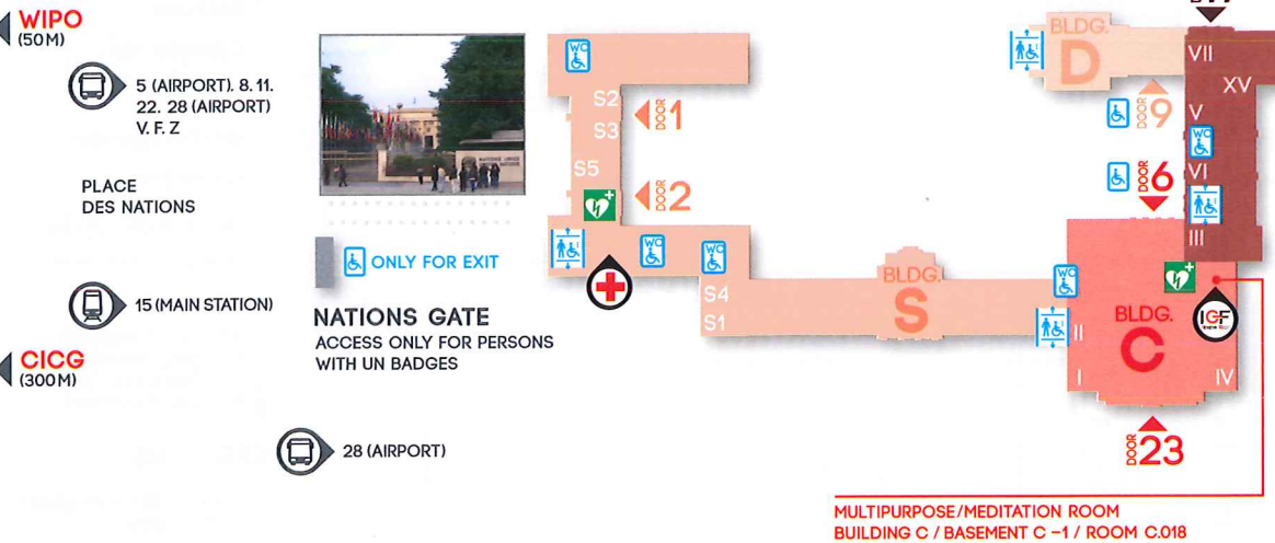
MULTIPURPOSE/MEDITATION ROOM BUILDING C / BASEMENT C -1 / ROOM C.018