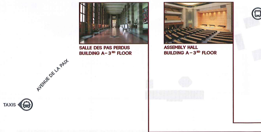
SALLE DES PAS PERDUS BUILDING A – 3 RD FLOOR