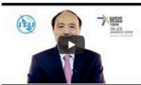
ITU Secretary-General: Houlin Zhao