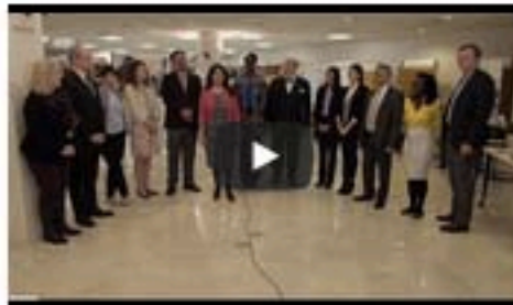
WSIS Forum 2018 Playlist