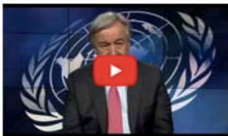
UN Secretary General: António Guterres