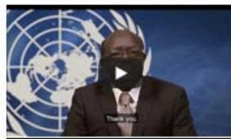
UNCTAD Secretary General: Mukhisa Kituyi