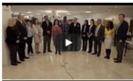
WSIS Forum 2018 Playlist