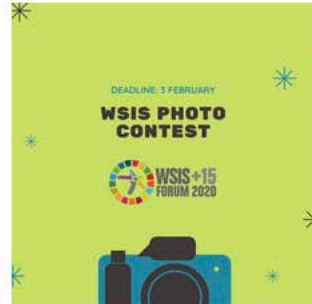
Photo Contest Submissions