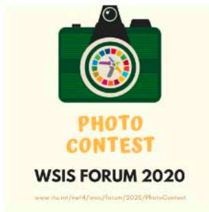
Photo Contest Submissions