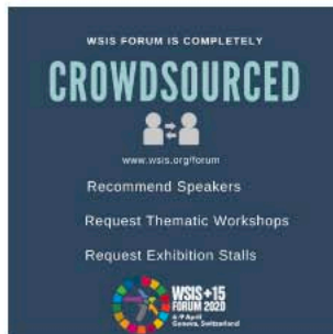
WSIS Forum OCP Official Submissions