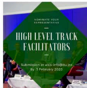
Nominate High-Level Track Facilitators