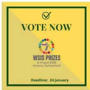
WSIS Prizes Voting Phase