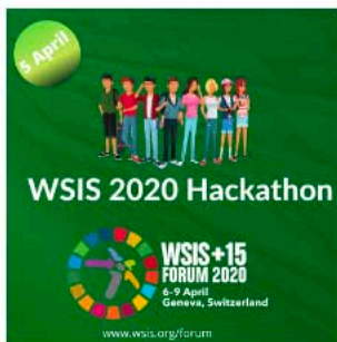
Apply for Hackathon